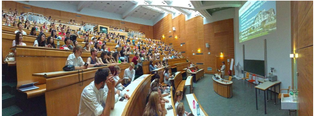
International Veterinary Students' Association 2016

The International Veterinary Students' Association (IVSA) is a not-for-profit non-governmental organization run by volunteer students from around the world. They aim to improve the standard of veterinary education internationally in order to "benefit the animals and people of the world".