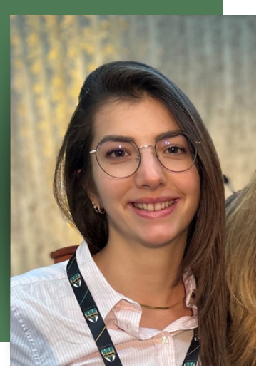
MICHELLE FONTANA PUBLIC RELATIONS