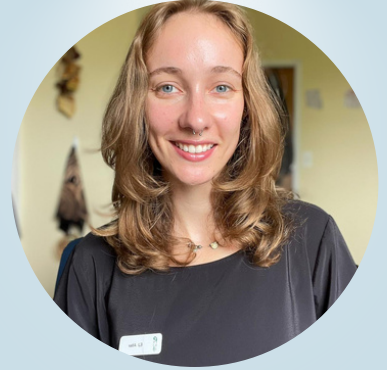
EJ ALTER NEW ZEALAND COLLEGE OF CHIROPRACTIC

Set bold goals, share them, and surround yourself with people who believe in them. Building clubs and fundraising isn't easy, but it's deeply rewarding. This isn't just a club—it's a space to grow, lead, and make memories that last a lifetime.